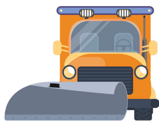
BLE asset tag on plow blade

The asset tag can be attached to any removable or transferrable winter maintenance equipment such as a plow blade etc., for real-time tracking. The CTM-ONE wireless gateway gathers the data while the asset tag is active on the equipment and sends the data to the Cypress VUE platform to generate meaningful reports.