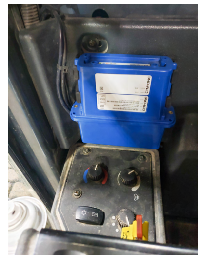
CTM-ONE grader install

Reliably track, monitor and control assets to improve productivity and fleet safety in one single platform.