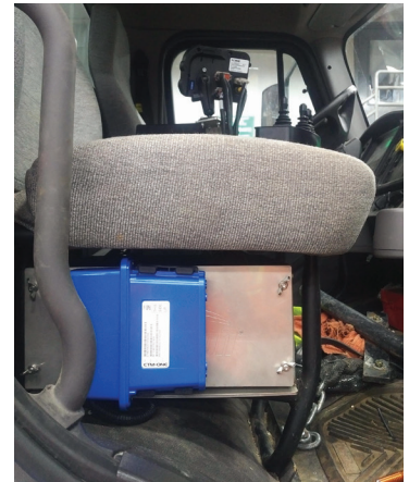
CTM-ONE salt truck install

It includes all the same hardware and functions as the regular CTM-ONE and features a discreet grey colour to blend in on vehicles.