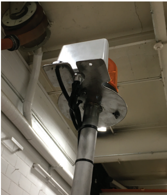
CTM-ONE Blade tow plow install

The CTM-ONE is built with a variety of data interfaces, advanced power management and GNSS. The wireless gateway can be customized and built to fit your exact business needs. The CTM-ONE has internal antennas and an optional cable cover that provides an extra level of protection. Users can reduce installation time by using a single wire hookup for compatible CAN Bus systems.