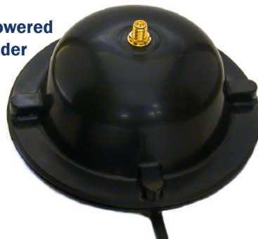
Externally Powered Range Extender