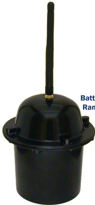
Battery Powered Range Extender